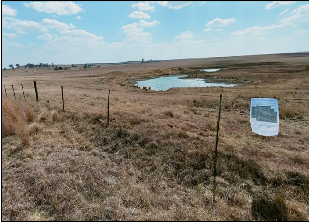
Site Notice 1:

On site notices was placed on the 14 th of September 2023, to bring attention to the Application for Environmental Authorisation for the utilisation of a Borrow pit in Lindley.