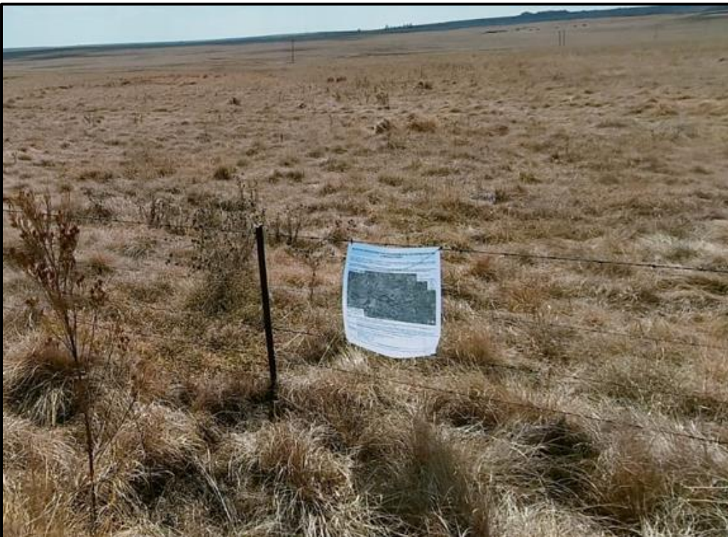
Site Notice 2: