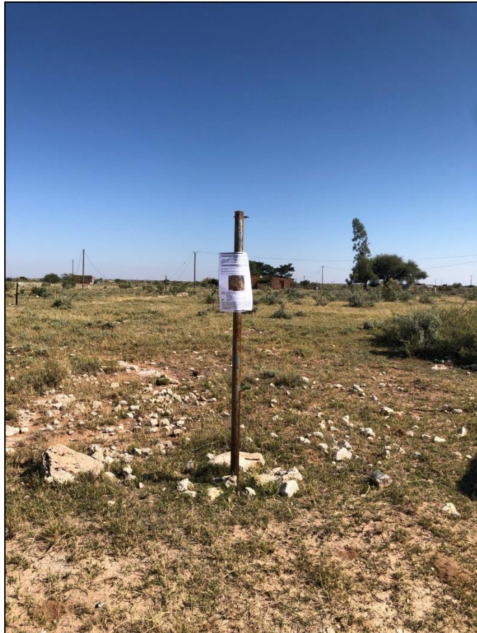
Site Notice 2: 27°16'16.3" S ; 23°35'56.2" E