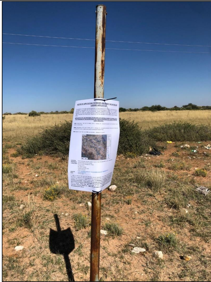
Site Notice 1: 27°16'41.4" S ; 23°36'14.7" E